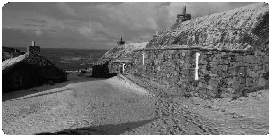
Gearrannan village in winter.

out to tourists looking for some solitude. If you are interested, a more detailed story and photographs will follow in another issue of Sidevalve News .