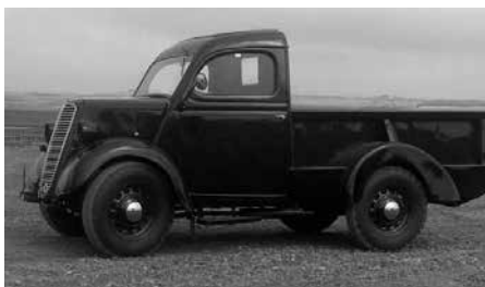
Photo 5 support until he knows if the fabric is involved or not. Although the matter should have been resolved by the time this is printed, can we have your ideas on the subject, as such items are not

My only information as registrar is on my C van, which has a similar wooden rear. Initially I have had to nail the fabric to the wood but at times of heavy rain, water did get into the cab, whereas at the van rear, where the van bodywork fabric was pinned over the top edge, no water was visible even at times of much soaking. Les not surprisingly does not want to nail the cab's metal lip down to the wood roof