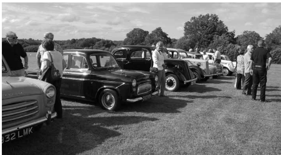
Cars at the AGM