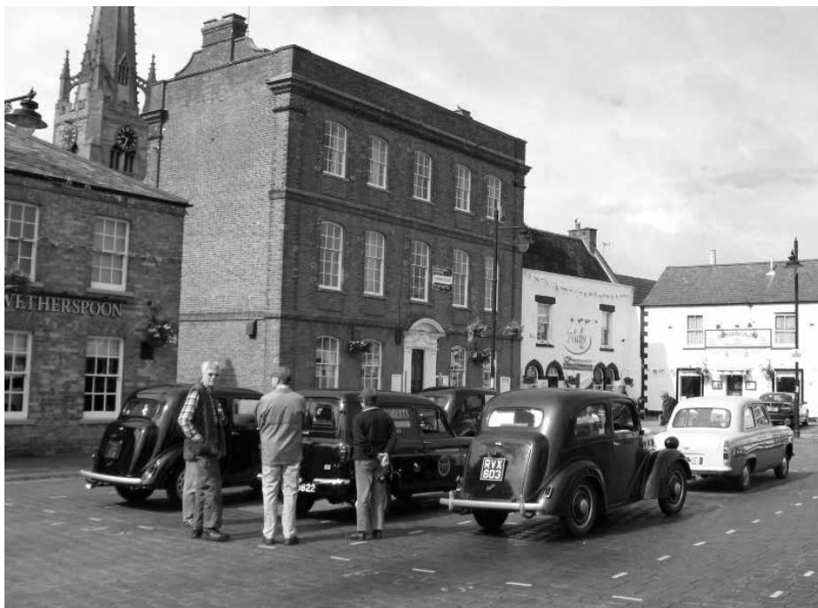
Eastern Sidevalve Day