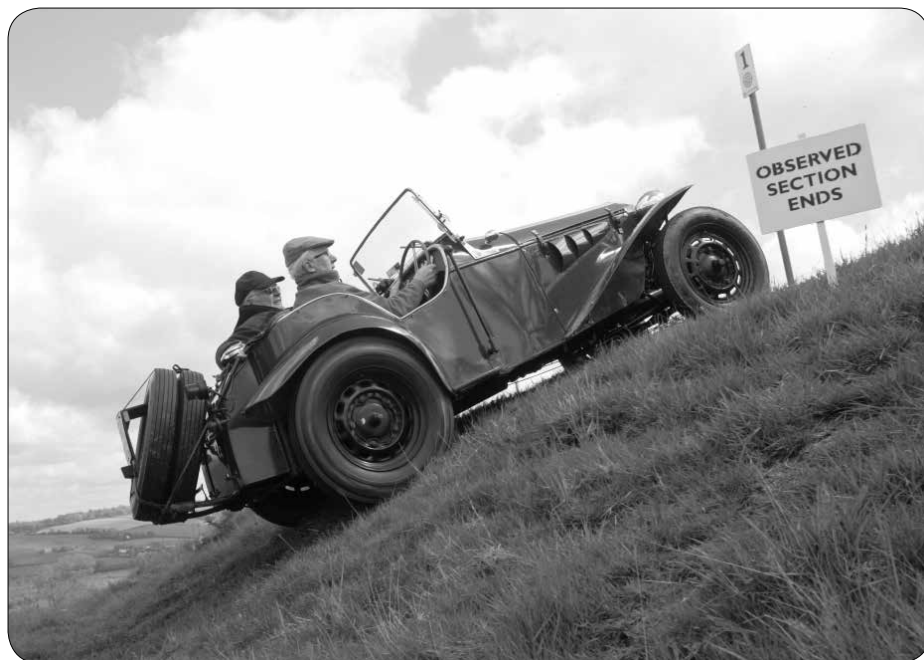
Dellow clears the section.

The organisers asked participants to wear period dress and there were many tweed sports jackets and flat caps on display. In addition the event had been promoted as a reunion for ex-trials drivers and they came in great numbers. Very quickly a gentle relaxed atmosphere came over the whole proceedings with people greeting old friends they had not seen for 20 years.