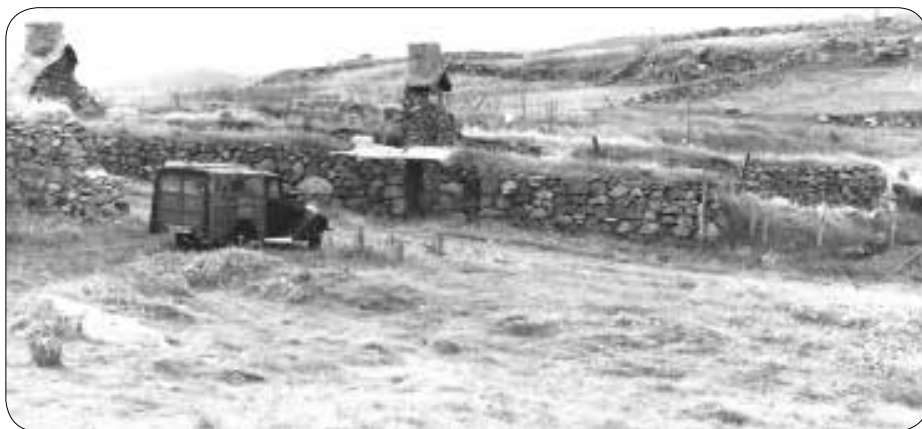
Gearrannan village in the early eighties.

Western Isles for a tour of the islands in early 1980s. Some 1,400 miles were covered with some breakdowns on the way! We camped in the ruins of the village illustrated here before the houses were renovated and rented