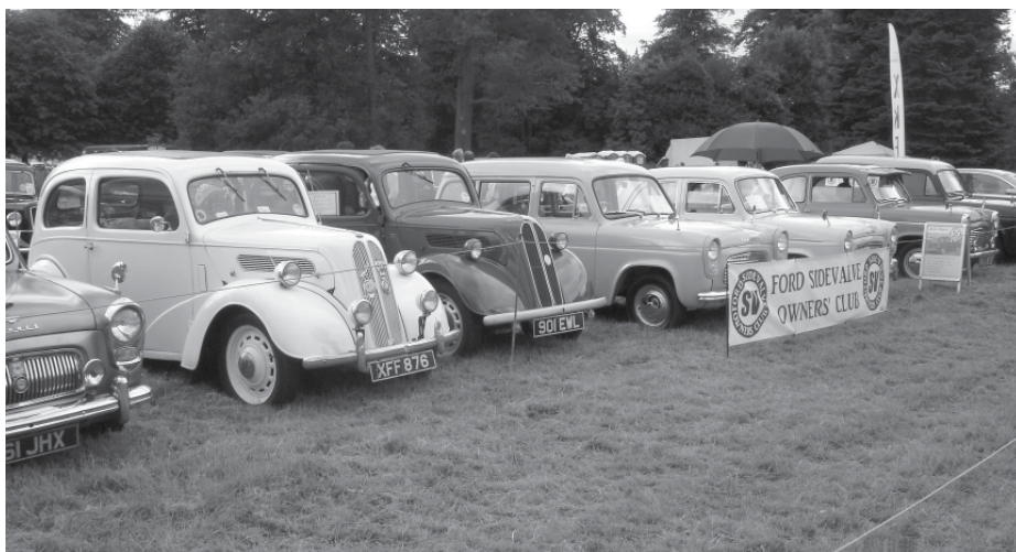
Groombridge Place Show