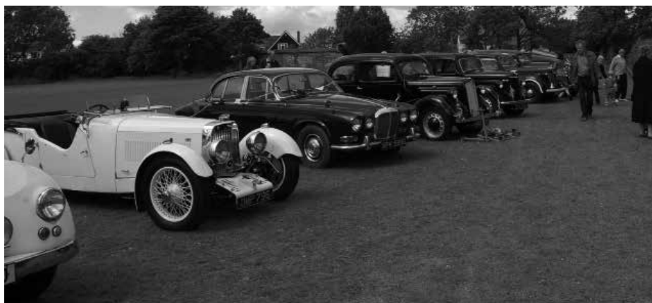
Village fete celebrating Diamond Jubilee.

In the April magazine the book The Lane Via Benghazi was mentioned, about an Upright Prefect that the owner hoped to drive to New Zealand. This book is an excellent read. I purchased one off the Internet and read it very quickly while on holiday, and it is now being passed around the North London Group members.