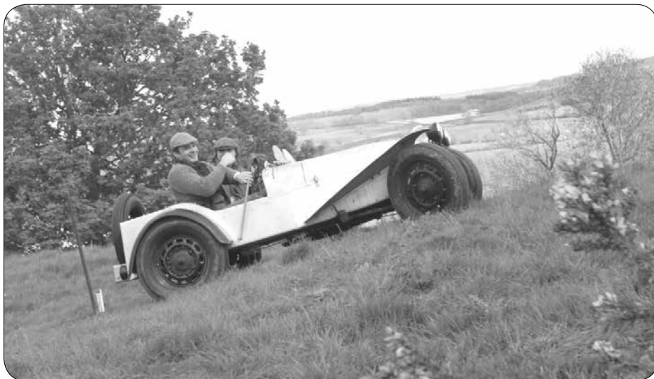
1172cc Sidevalve-based trials car.

After the wettest April on record the sun shone for the first time in well over a month, leaving the site in prime condition for the first event under the banner of the Historic Sporting Trial Association. The organisation of the event was in the hands of SportingTrials.com, a club that has its roots in the famous old trials club, Kentish Border Motor Club.